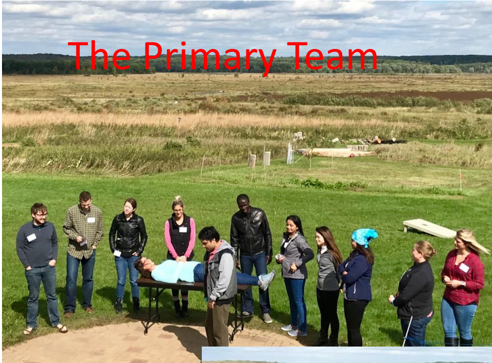
The Primary Team