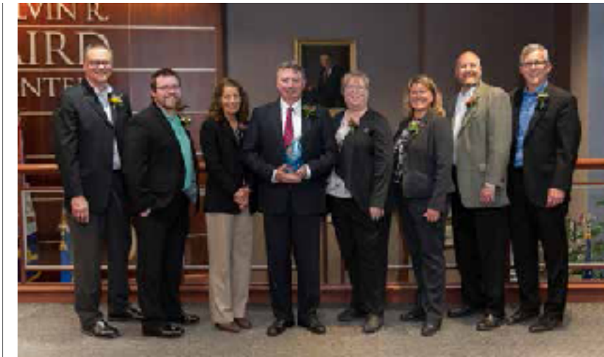
Moving communities forward guides Forward Bank in its donations to support health care in rural Wisconsin.