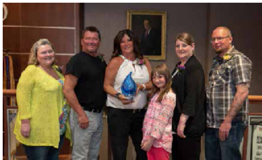
For the past 15 years, the Snoopy Pole Classic has donated over $70,000 to Children's Miracle Network Hospitals at Marshfield Children's Hospital.