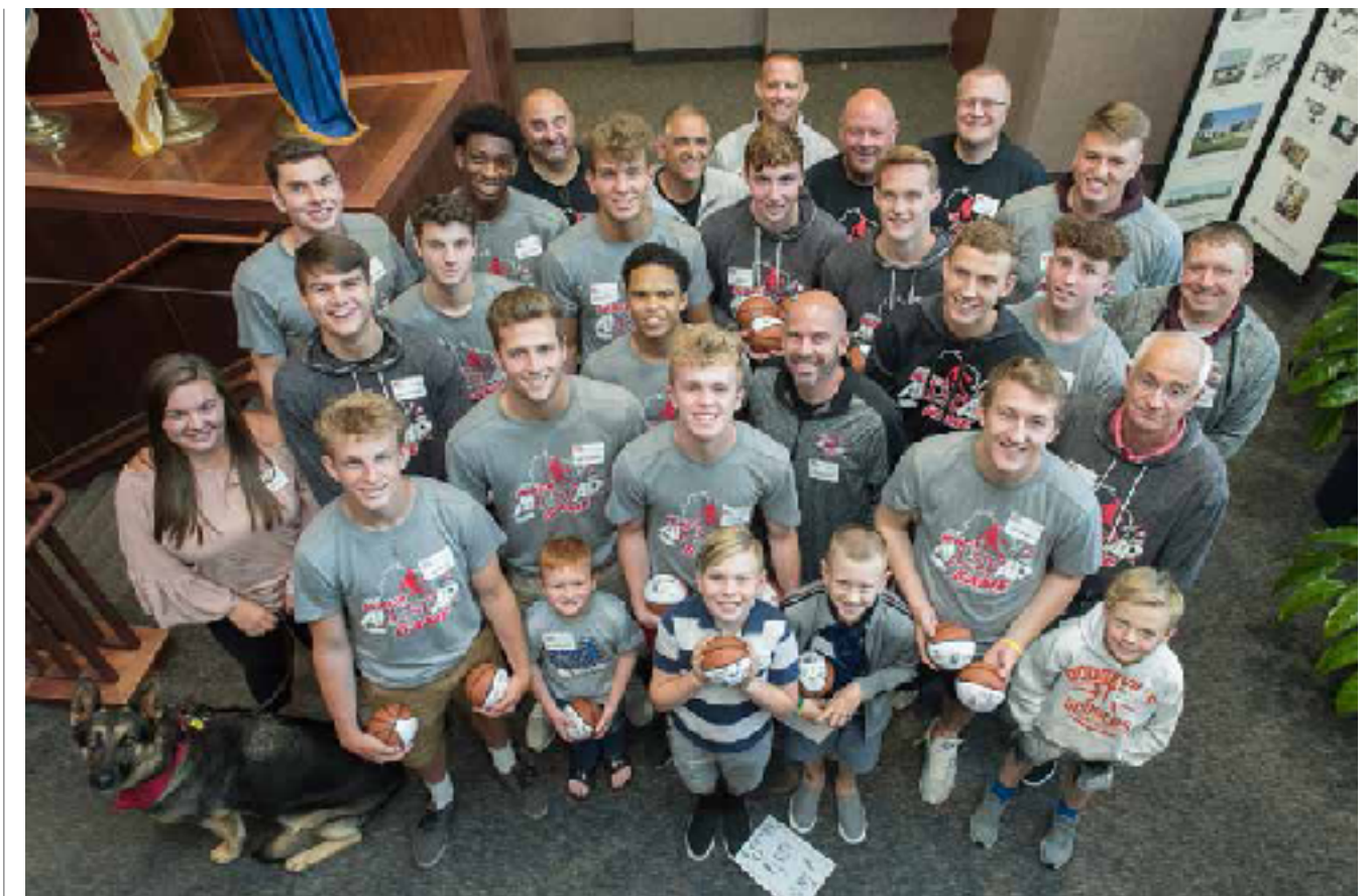
The Wisconsin Basketball Coaches Association All-Star players visited Marshfield Children’s Hospital along with the Midwest Athletes Against Childhood Cancer (MACC) Fund in June to see the impact of the MACC Fund’s support for pediatric cancer research.

MACC Fund support continues with a $100,000 gift to pediatric cancer research at Marshfield Clinic Health System