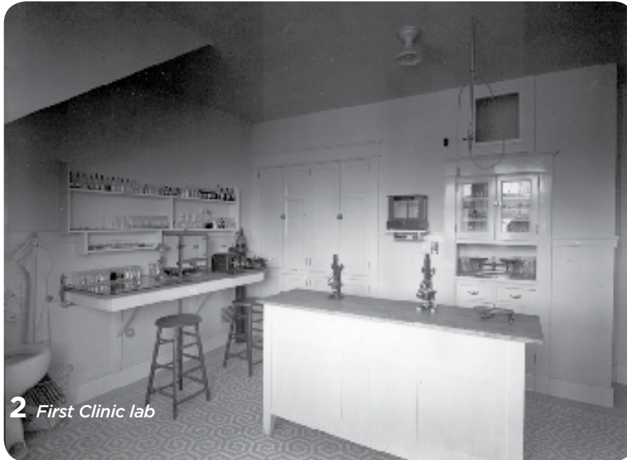
2 First Clinic lab