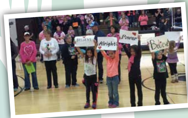
Students and survivors during intermission celebrating all the cancer survivors with a song, flowers, and signs of encouragement.