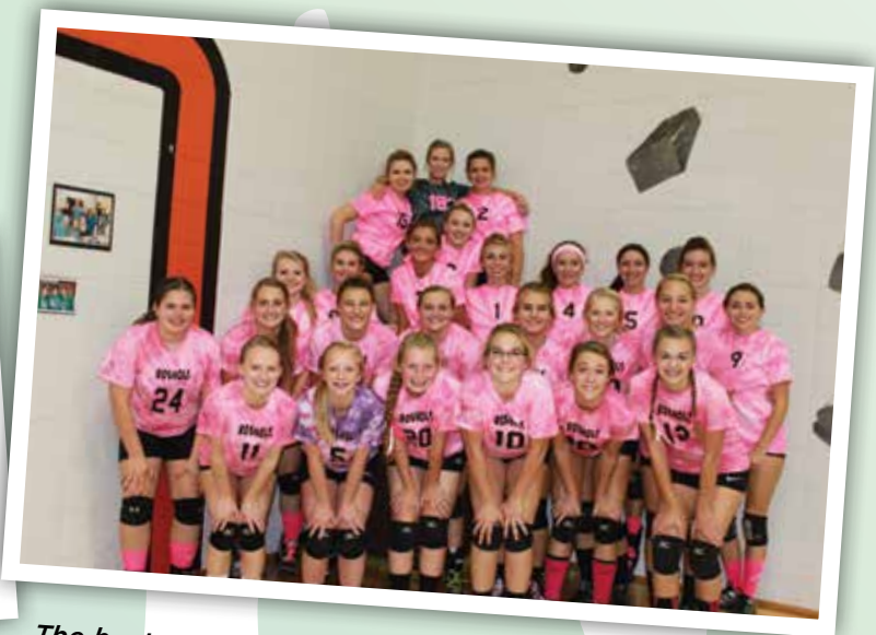
The hosts of the “Dig Pink” volleyball game: Iola-Scandinavia High School volleyball team.